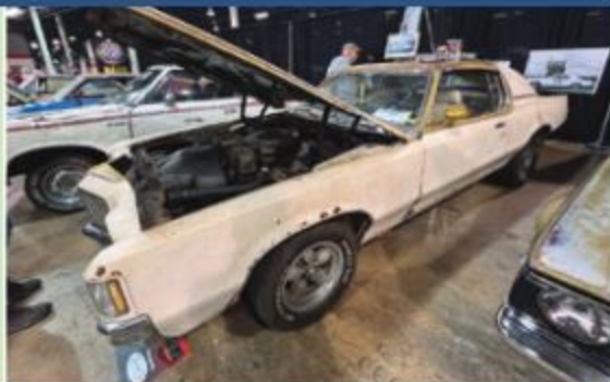
This rare 1972 Hurst SSJ Grand Prix was part of the ever popular "Barn Finds" display.