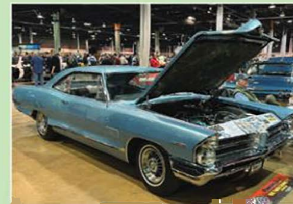
1965 2+2 in Fontaine Blue with 421 Tri-Power.