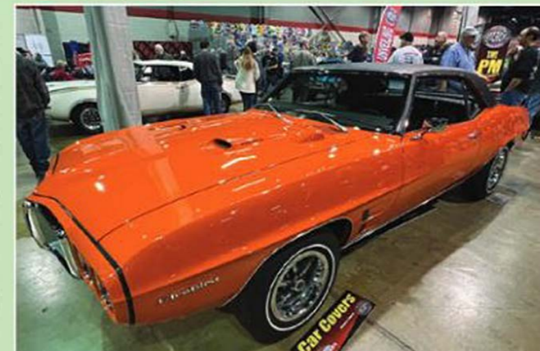
A beautiful 1969 Firebird 400 with Ram Air IV engine in Carousel Red.

M uscle car nirvana returned to the Chicagoland area this past November at the Donald Stephens Convention Center in Rosemont, Illinois. Held at a time of year when Midwest temperatures can be somewhat chilly or downright frigid, this annual paradise of power never fails to warm the hearts of all who attend.