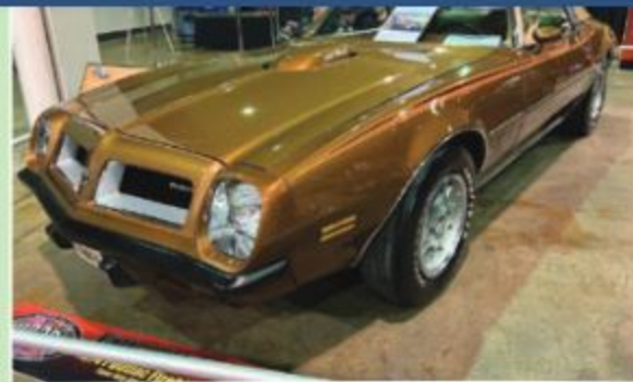
This 1974 SD 455 Formula in Crestwood Brown is believed to be the first '74 Super Duty produced.