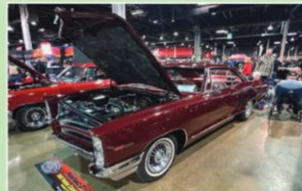
A 1966 2+2 with 421 and 8-lug wheels.