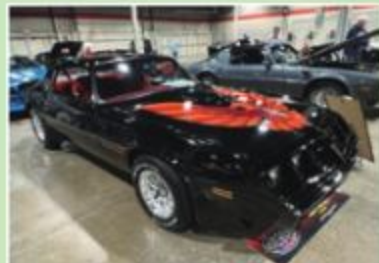
A 1980 Trans Am in Starlight Black with red hood bird decal and Carmine interior.