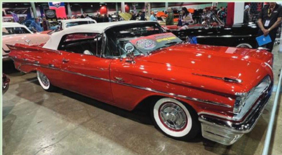
The red-and-white color combination is striking on this 1959 Bonneville convertible. It features wide whitewalls, a Tri-Tone bucket seat interior and Tri-Power under the hood.