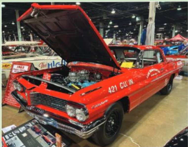
A 1962 SD 421 Catalina looking like it did back in the day.