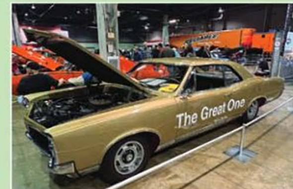
The Great One! An original Thom McAn promotion prize contest 1967 GTO in Tiger Gold.