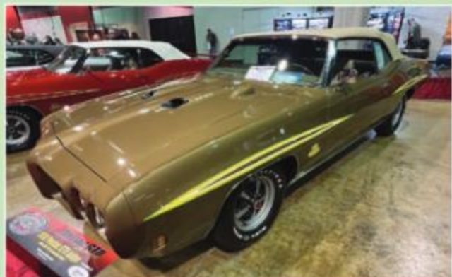
At this show the ultra rare is common. This 1970 Judge convertible was one of eight on display with an original Ram Air IV engine.