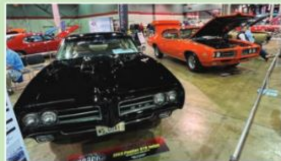
Two '69 Judges, one in Starlight Black and the other in Carousel Red.