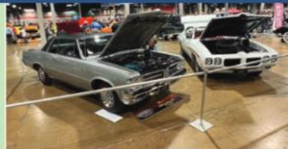
1964 GTO and 1970 GTO Judge, two of many GTOs on display.