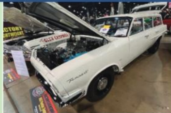
This 1963 Tempest Station Wagon is one of six produced.