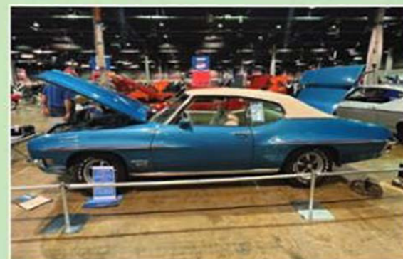
An unrestored 1971 GT-37 in Lucerne Blue with a 455 H.O. engine and very rare rear Judge airfoil.

Flanking the bright red-carpeted aisleway were nine 1970 GTO Judge convertibles — eight of which featured the Ram Air IV engine and one with a 455 engine. Oppo-