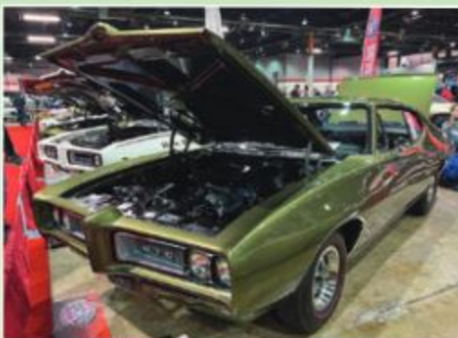
The mid-year option of a Ram Air II powers this Verdoro Green 1968 GTO.